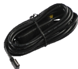
USB-Type C cable